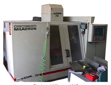
Cincinnati Milacron VMC 1250C Machining Center